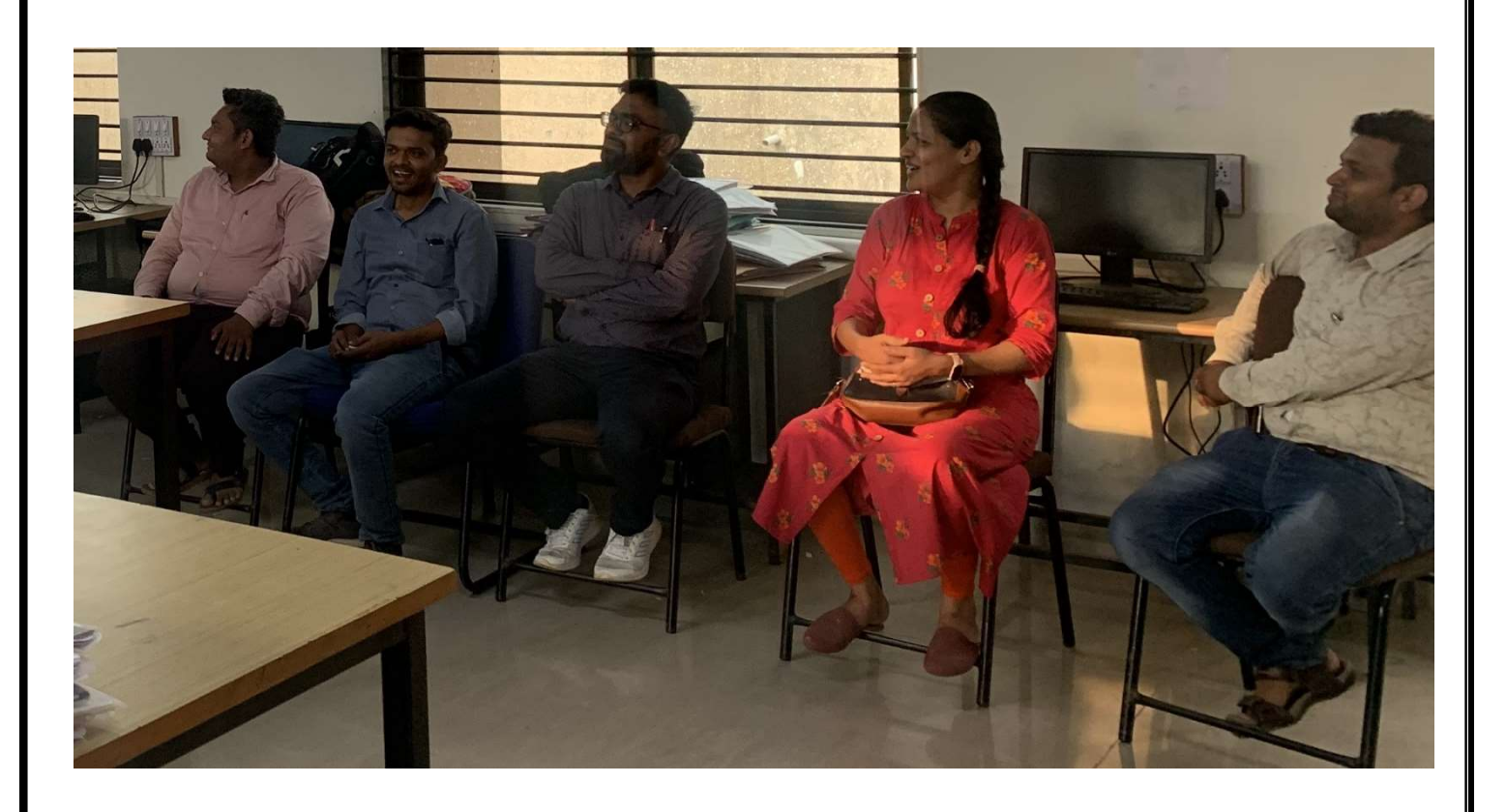
Jury panel for internal hackathon for SIH 2023