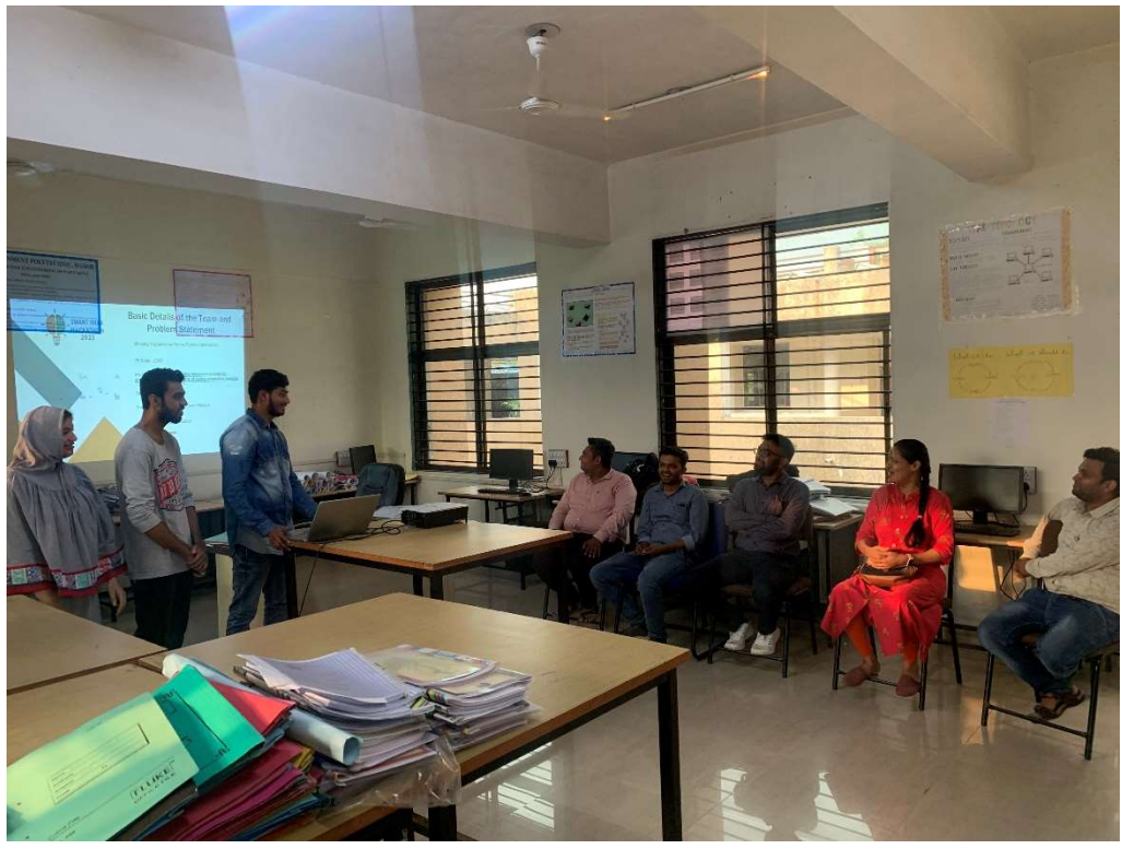
Participants presenting their project ideas